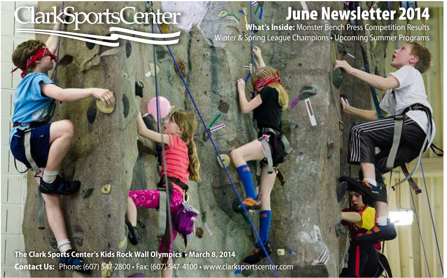
The Clark Sports Center's Kids Rock Wall Olympics • March 8, 2014

Contact Us: Phone: (607) 547-2800 • Fax: (607) 547-4100 • www.clarksportscenter.com